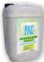
STD Parks, gardens and Agriculture