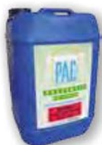
HP Civil Engineering/ Construction